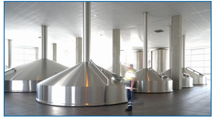
Paulaner Brewery in Munich, Germany.